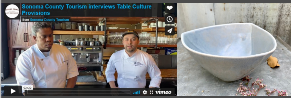
Table Culture Provisions restaurant paired with Ceramics by Kala Stein, for the "Out of the Ordinary" story in the Resiliency Showcase.