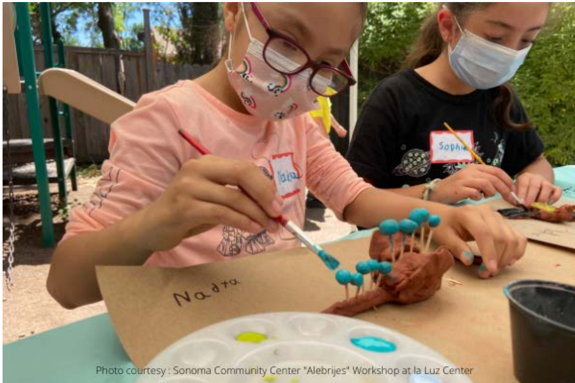
"Alebrijes" Workshop at la Luz Center

Admin Meetups - Supportive and collaborative meetings of superintendents, principals, and curriculum & instruction directors . Topics: Social Emotional Learning, LCAP, Title 1 Funding, and Portrait of a Graduate