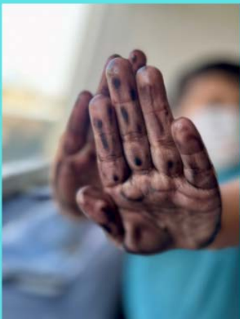
Dunbar student participates in "Prints, Painting and Poetry" -a program created by Art Escape.