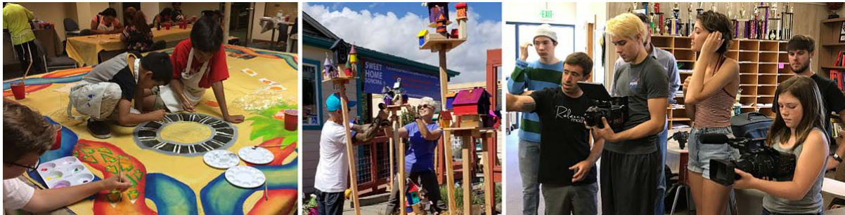
Recent Grantees, left to right: Museum of Sonoma County, Art Escape, and AVFilm