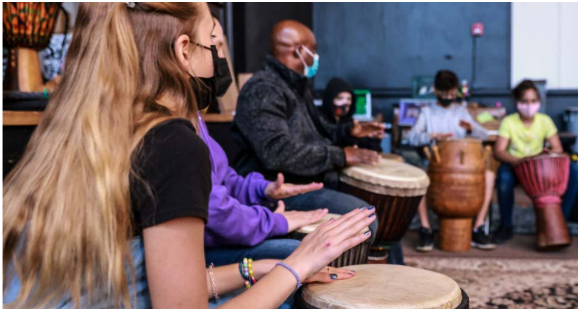
Creative Sonoma Grantee, Luther Burbank Center for the Arts: 6h graders learning African drumming, 2022.