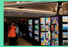
Petaluma City Schools