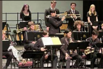
NorCal Honor Jazz Band