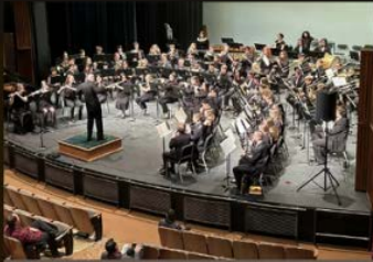
NorCal Honor Band